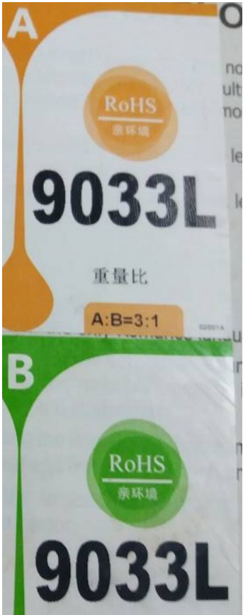
A-B Silicone Glue